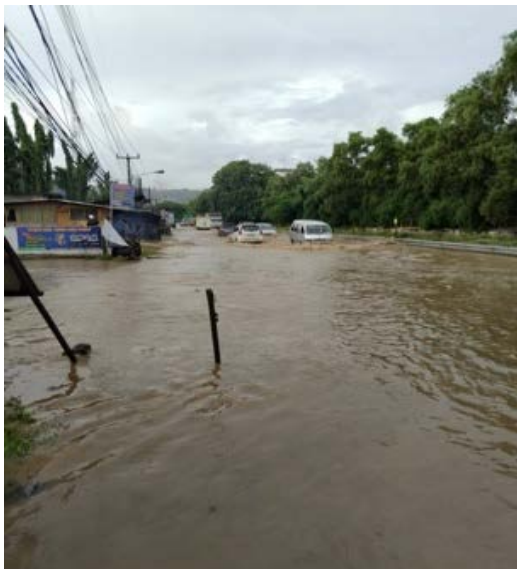
Picture 5 Flooding that occurred around the Krakatau Steel area.

Kubangsari is one of the areas in Cilegon that frequently experiences flooding during the rainy season. According to local residents, over the past 10 years there have been two to three major flood events during the wet season. In 2024, a significant flood occurred, not due to heavy rainfall, but from other environmental disruptions.