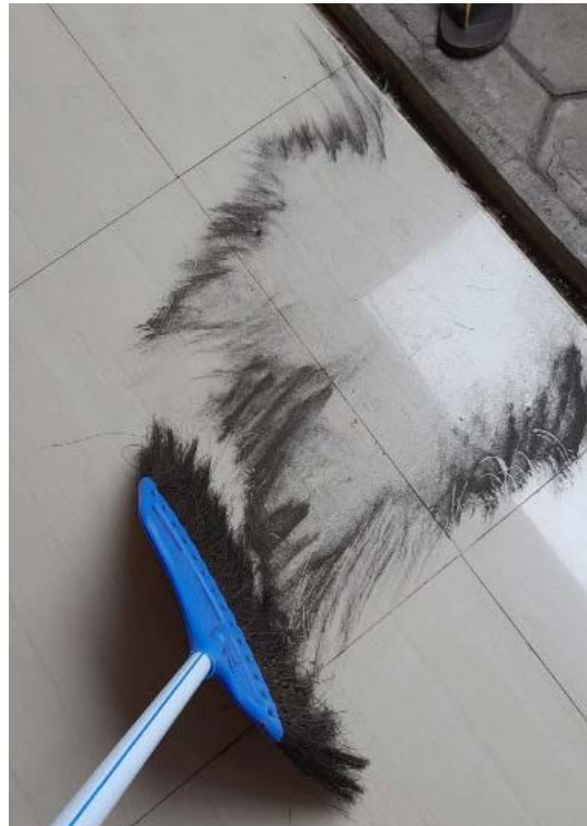
Picture 3 Black dust contaminated the yards of Cigading residents.

This contradicts the legal responsibilities of the local government, which is mandated by Minister of Environment Regulation No. 12 of 2010, and further detailed in BAPEDAL Decree No. 205 of 1996 on Technical Guidelines for Controlling Air Pollution from Stationary Sources. 15 These regulations clearly state that local governments are required to monitor compliance by companies emitting stationary-source pollution. 16