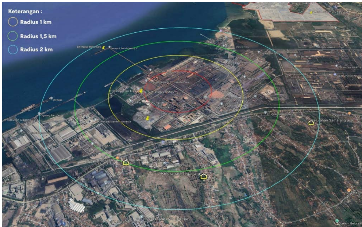
Picture 1 Radius of research area.

WALHI Jakarta conducted in-depth observations and interviews with the community around the steel industry in Cilegon, precisely PT. Krakatau Steel and PT Krakatau Posco. There are three areas that are explored in this process, namely Kelurahan Samangraya (located approximately 1 kilometer from the residential area to the PT Krakatau Steel facility), Kelurahan Tegalratu (located approximately 1 kilometer from the residential area to the PT Krakatau POSCO), and Kelurahan Kubangsari (located approximately 1.8 km between Krakatau POSCO and the residential area). These three communities are in close proximity to the industrial sites and have been directly affected throughout all stages of industrial activity, from pre-construction to post-operation phases.