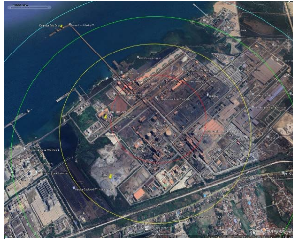
Picture 7 Krakatau Steel Area in 2024